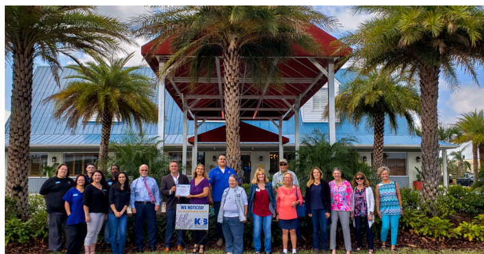
Melbourne All Suites Inn - Award Presentation